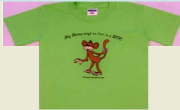
"My Mama Says We Live in a ZOO!"