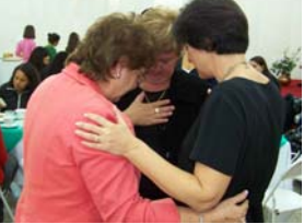
Many Received Christ as Savior during the twenty-three ZooKeeper events held in Brazil.

TO OUR SUPPORTERS Thank you from the bottom of our hearts for all you gave to support our mission projects in 2008. Some of you were extraordinarily generous, giving above and beyond. Without your generous giving it would not have been possible for us to have reached so many precious souls for Christ. To God be the Glory!